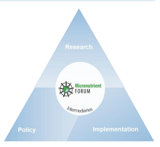
The Forum works with research, implementation and policy groups to fill knowledge gaps, improve collaboration, and reduce overlaps.

Established in 2006 as the result of a merger between the International Vitamin A Consultative Group (IVACG) and the International Nutritional Anemia Consultative Group (INACG), the Forum held successful global meetings in Istanbul in 2007 and Beijing in 2009. In 2011, a group of leaders in the field produced a report supporting the need for the Forum due to its usefulness as a means for exchanging scientific, implementation, and policy information on micronutrients among scientists and public health professionals. Specifically, the report recommended that the Forum focuses on: scaling up of effective programs; improved biomarkers, program monitoring and evaluation; and multi-sectoral integration of micronutrient activities.