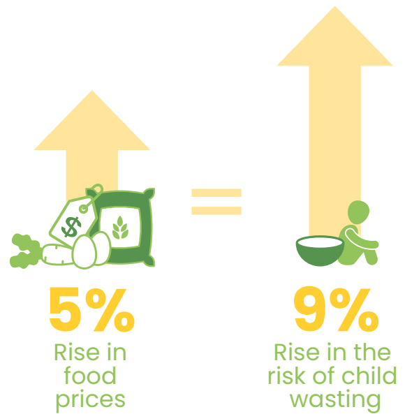
Figure 2. Food price inflation dramatically impacts wasting: a five percent rise in food inflation equals a nine percentage increase in risk of moderate/severe wasting

The impact was much larger in particular sub-population groups. The risk of wasting from food inflation is about 1.5 times higher for children in households that are asset-poor compared to children in non-poor households 7 . In rural areas, children in households that do not own land and cannot grow their own food